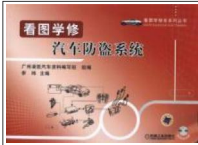
Figure school repair car alarm system (with CD) plug-in vehicle series study